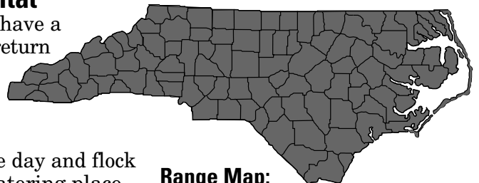
Range Map: Found statewide.

Complete nesting requires about one month from constructing the nest and egg-laying to the exit of the young. Half of all nesting attempts end in failure.