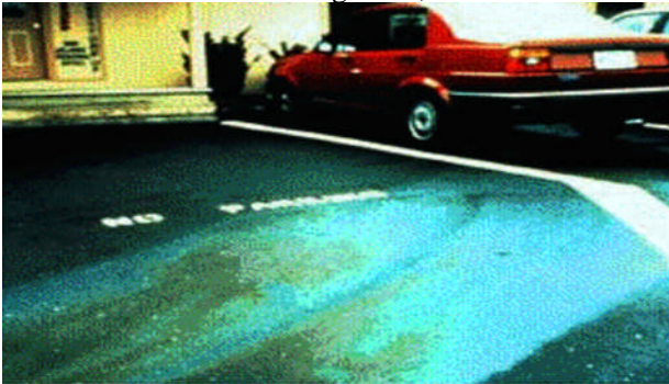
Parking lot runoff

Storm water is also directly injected to the subsurface through Class V storm water drainage wells. These wells are used throughout the country to divert storm water runoff from roads, roofs, and paved surfaces. Direct injection is of particular concern in commercial and light industrial settings (e.g., in and around material loading areas, vehicle service areas, or parking lots).