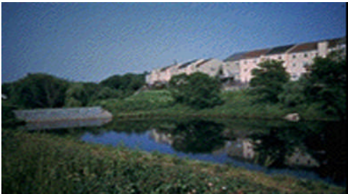
Storm water pond

Storm water ponds (wet ponds) consist of a permanent pond, where solids settle during and between storms, and a zone of emergent wetland vegetation where dissolved contaminants are removed through biochemical processes. Wet ponds are usually developed as water features in a community, increasing the value of adjacent property. Other than landscape maintenance, only annual inspection of the outlets and shoreline is required. Vegetation should be harvested Storm water pond every 3 to 5 years, and sediment removed every 7 to 10 years. Wet ponds can achieve 40 to 60 percent phosphorus removal and 30 to 40 percent total nitrogen removal.